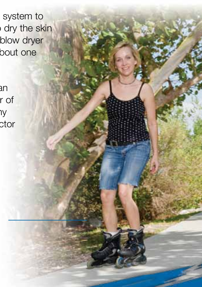
Cricket – Ostomy surgery 1994